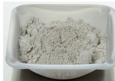
Demir Sülfat EMCEferro II-H