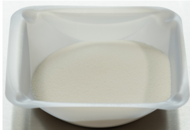
Vitamin A 250 IU SternVit TR 250