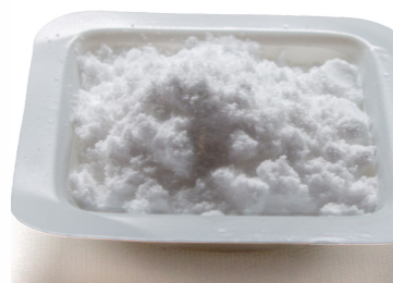
Vitamin B8 (İnositol) SternVit Inositol