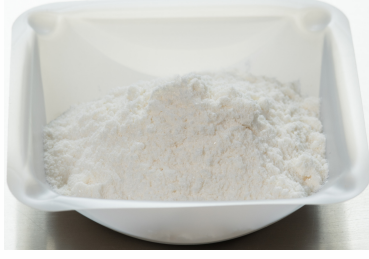
Vitamin B6(Piridoksin) SternVit Pyridoxin HCL