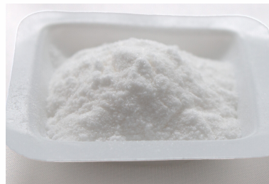
Vitamin C(Askorbik Asit) ELCO P-100K