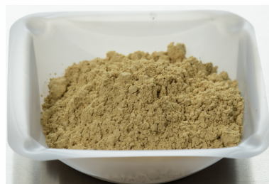
EDTA Demir Iron EDTA