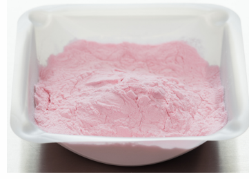
Vitamin B12 (Siyanokobalamin) SternVit B12