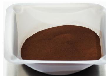
Demir Fumarat SternMin Ferrous Fumarate