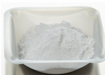
Çinko SternMin Zinc