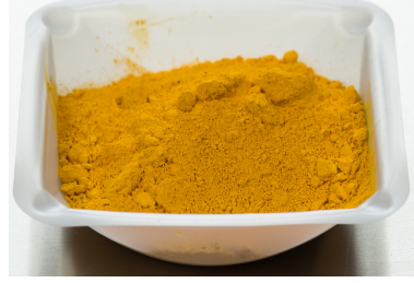
Vitamin B2(Riboflavin) SternVit B2