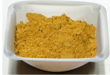
Vitamin B9(Folik Asit) SternVit Folic Acid