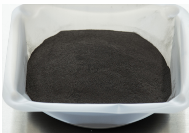
Elektrolitik Demir EMCEferro Elektrolytic