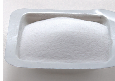
Vitamin B5(Pantotenik Asit) SternVit B5