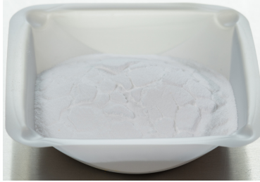
Vitamin B3(Niasin) SternVit Niacin